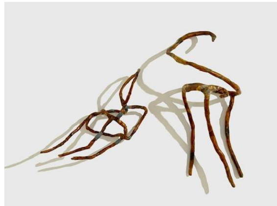
Fiberglass epoxy and newspaper on aluminum wire 20 x 7 x 6 in 50.8 x 17.8 x 15.2 cm