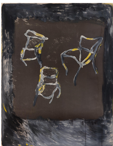
Mixed media on paper 48 x 37 1/2 in 121.9 x 95.3 cm