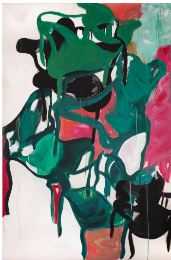
Acrylic on canvas 81 1/2 x 52 1/2 in 207 x 133.3 cm