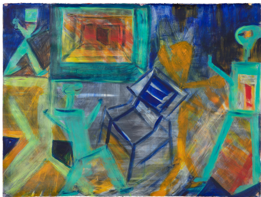
Acrylic on paper 22 1/2 x 30 in 57.1 x 76.2 cm