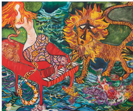
Oil on canvas 58 x 70 in 147.3 x 177.8 cm