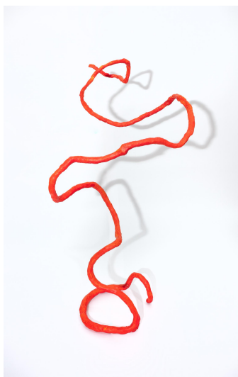
Resin with acrylic paint on aluminum wire 37 x 20 in 94 x 50.8 cm