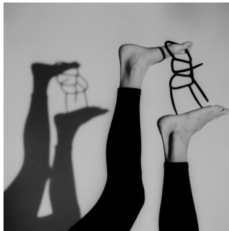
Digital C-print on Fujicolor Crystal Archival Paper 37 x 37 in 94 x 94 cm Number 5 from an edition of 10 plus 2AP