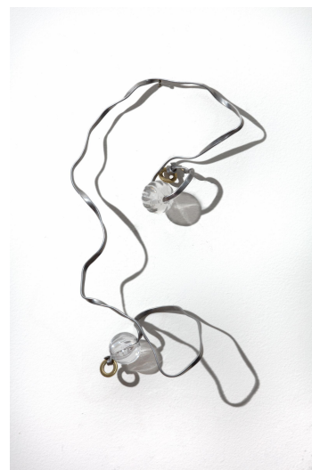
Vintage lucite, gold plated brass, and 10mm flat aluminum wire 17 x 5 in 43.2 x 12.7 cm