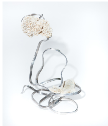
Omani coral and 10mm flat aluminum wire 10 x 6 1/2 in 25.4 x 16.5 cm