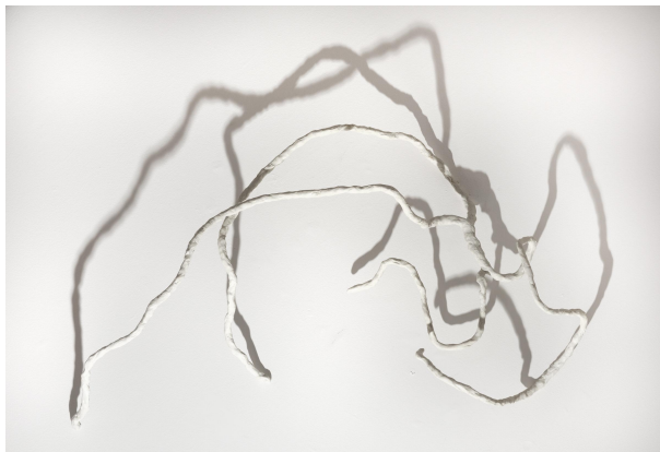
Resin with acrylic paint on aluminum wire 26 x 45 in 66 x 114.3 cm