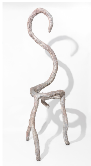
Fiberglass epoxy on steel rod 67 1/2 x 19 in 171.4 x 48.3 cm