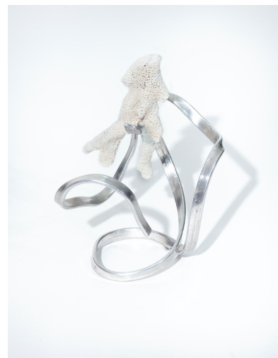
Omani coral and 10mm flat aluminum wire 5 1/2 x 3 1/2 in 14 x 8.9 cm