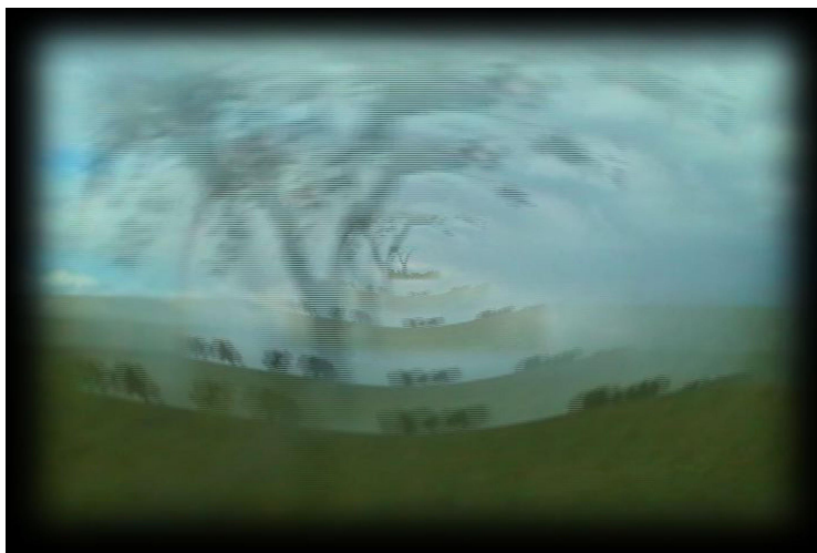
4K Ultra HD video Rt: 3:30 loop 2160 x 3840 pixels Edition of 5 plus 2 AP