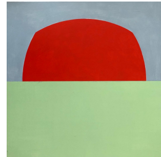
Image: Beto De Volder, Untitled , 2020, Acrylic on hardboard, 12 x 12 in

Landscapes & Drawings gives a view into Beto De Volder's (b. 1962, Buenos Aires, Argentina) persistent desire to artistically investigate drawing, color and the possibilities of the line. Since the early 2000s, De Volder has looked to these as core facets of his practice. Swirling, looping, and undulating, the lines he creates combine artistic precision and slowness with the visual suggestion of movement and speed. In recent years, the artist has explored these ideas in larger format, and especially in his dibujos calados , which are featured in the exhibition: sculptural, colorful works emphasizing positive and negative, which embody drawing in real space and look humorously to ideas of spontaneity and expression. In larger part, however, Landscapes & Drawings , presents a grouping of smaller-format drawings and paintings that let the viewer into a new and more intimate view of De Volder's meticulous and meditative practice. These untitled, delicate works once again bring up De Volder's continuous dialogue with line, but also showcase his concern with color relationships and the possibilities of painting.