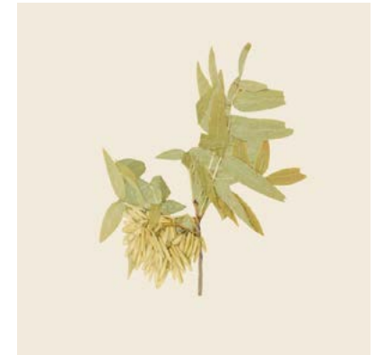
Fraxinus nigra , New York State