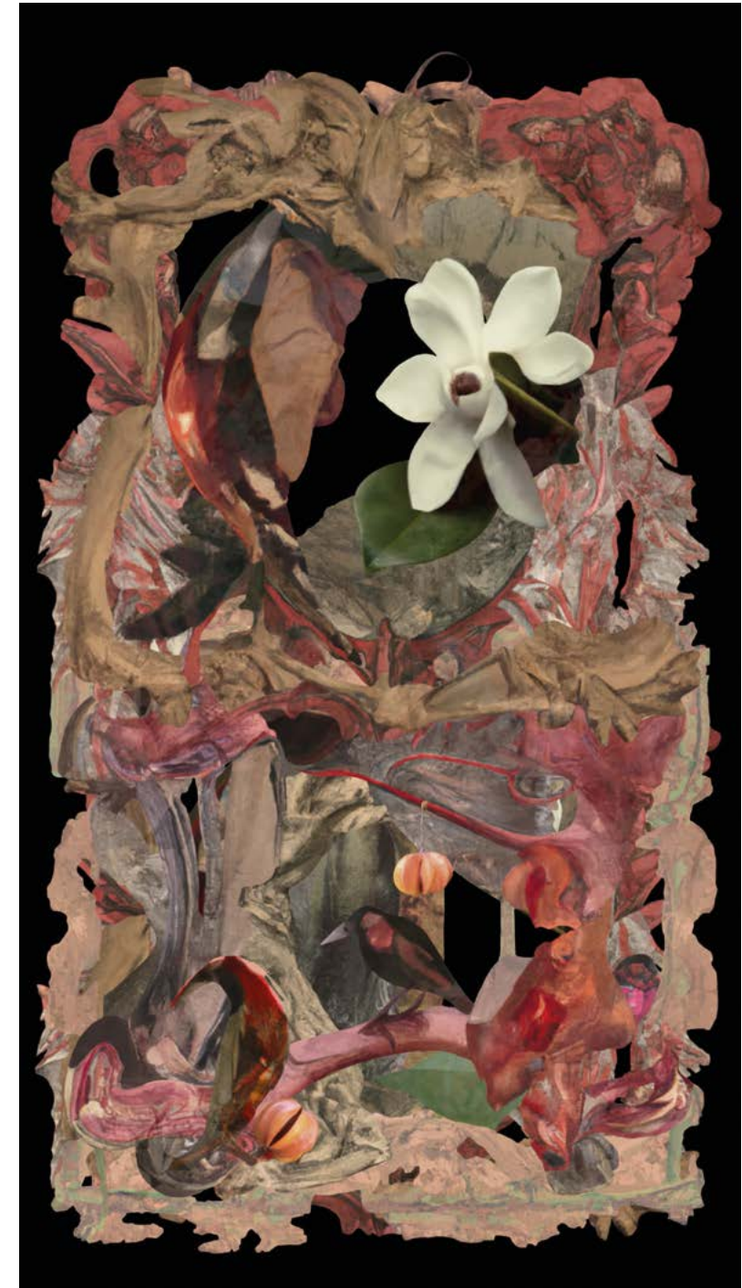
(Video Still B)

PLANTALIA , 2024 Digital video animation 5 minutes 20 seconds Edition of 5 plus 1 AP