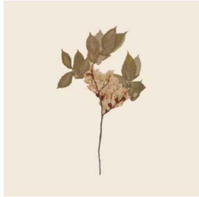
Ulmus americana 2, New York State