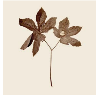
Hydrastis Canadensis , New York State