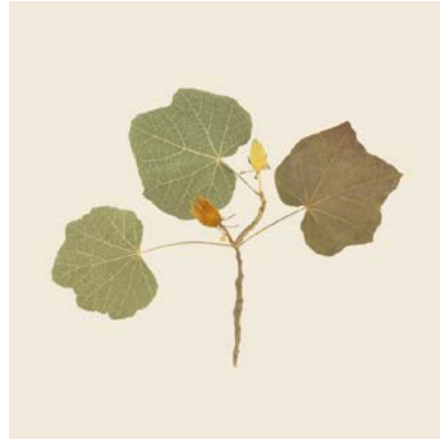
Hibiscadelphus stellatus , Hawaiian Islands