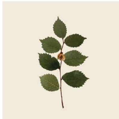
Ulmus americana , New York State