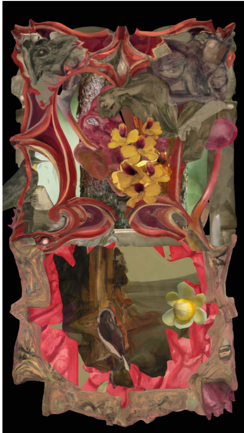
(Video Still A)

PLANTALIA , 2024 Digital video animation 5 minutes 20 seconds Edition of 5 plus 1 AP