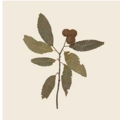
Castanea dentata , US