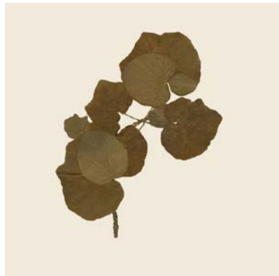
Hibiscadelphus wilderianus , Hawaiian Islands