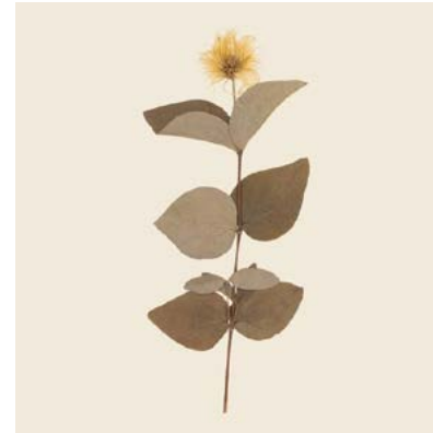
Clematis ochroleuca , Staten Island and Long Island

The Herbaria prints included in the present exhibition feature endangered plants native to the United States.