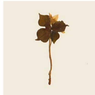
Trillium grandiflorum , New York State