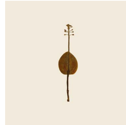
Malaxis bayardii , New York State