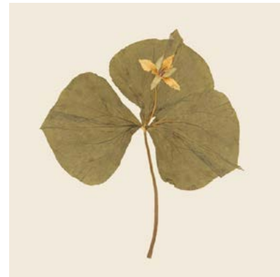
Trillium flexipes , New York State