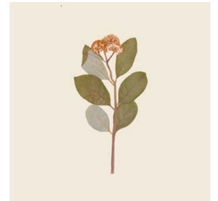
Asclepias variegata , New York State