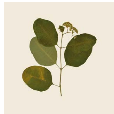
Asclepias variegata 2, New York State