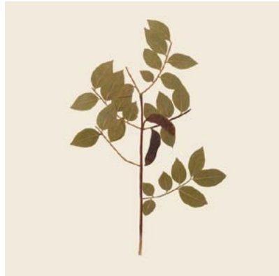
Gymnocladus dioicus , New York State