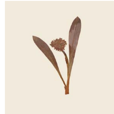
Helonias bullata , New York State