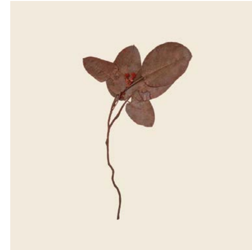
Epigaea repens , New York State