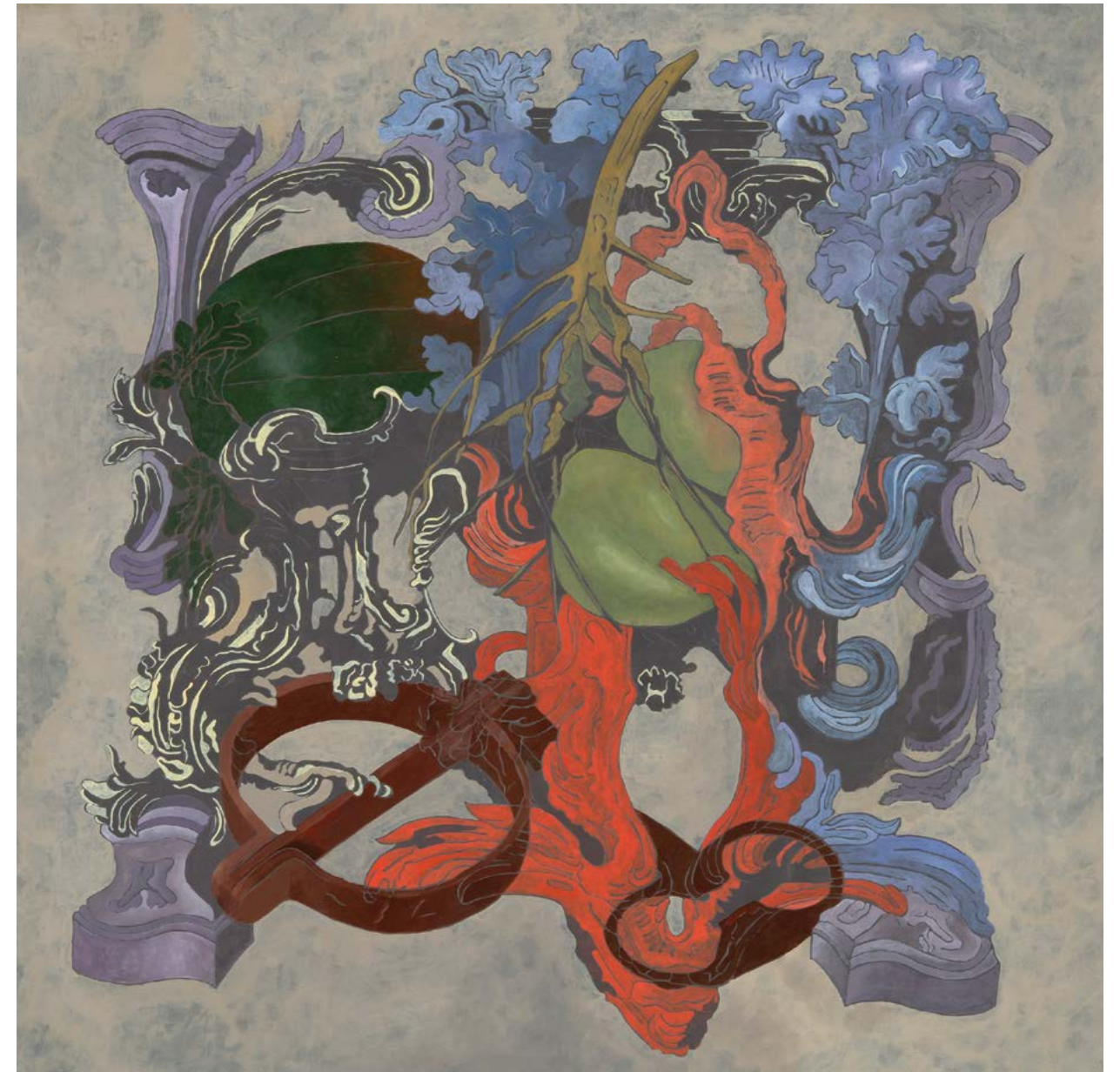
Firmamento (key) , 2020 Acrylic and oil pencil on canvas 31 ½ x 31 ½ in (80 x 80 cm)

Centuries ago, paintings, engravings, and drawings by European artists depicted the New World as an exuberant and seemingly boundless landscape, teeming with life and abundance. On the other hand, it was also portrayed as a wild environment in need of taming, cultivation, and evangelization. Today, if these artists were to revisit the landscapes they once depicted with such awe, they would likely encounter a vastly different scene—one marred by monoculture, aggressive real estate and logging, deforestation, pollution, and the irreversible loss of biodiversity. The glaring disparity between past depictions and present realities illustrates the consequences of humanity's exploitation and disregard for the natural world by economic forces.