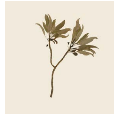
Clermontia multiflora , West Maui, Hawaii