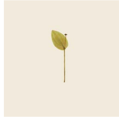
Malaxis bayardii 2, New York State