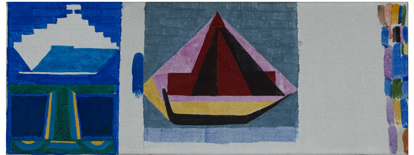
Untitled, 2022 Egg tempera on linen 6 3/4 x 17 3/4 in 17 x 45 cm