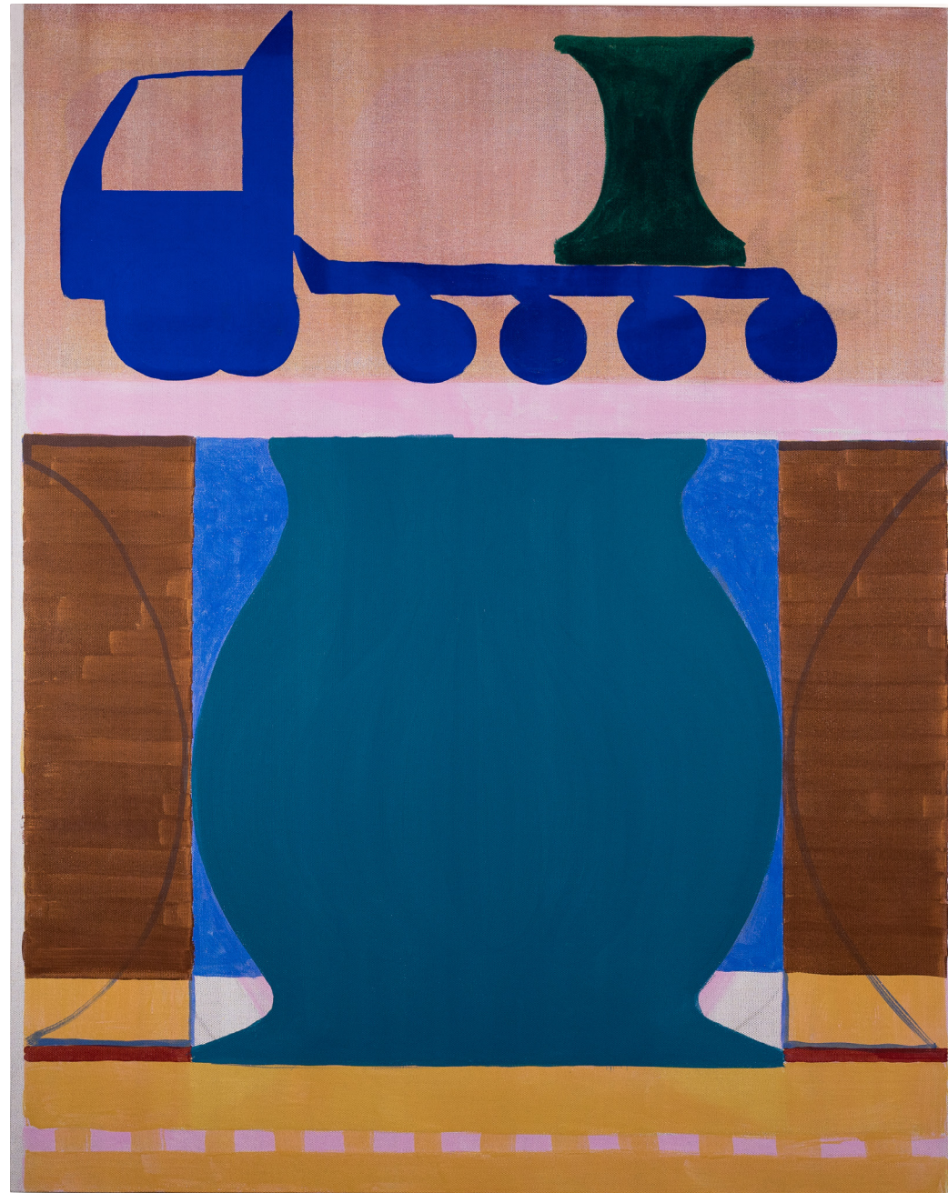
Untitled, 2022 Egg tempera on linen 50 x 39 3/4 in 127 x 101 cm