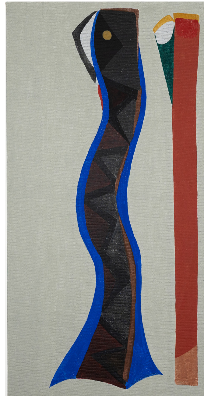
Untitled, 2022 Egg tempera on linen 31 7/8 x 15 3/4 in 81 x 40 cm