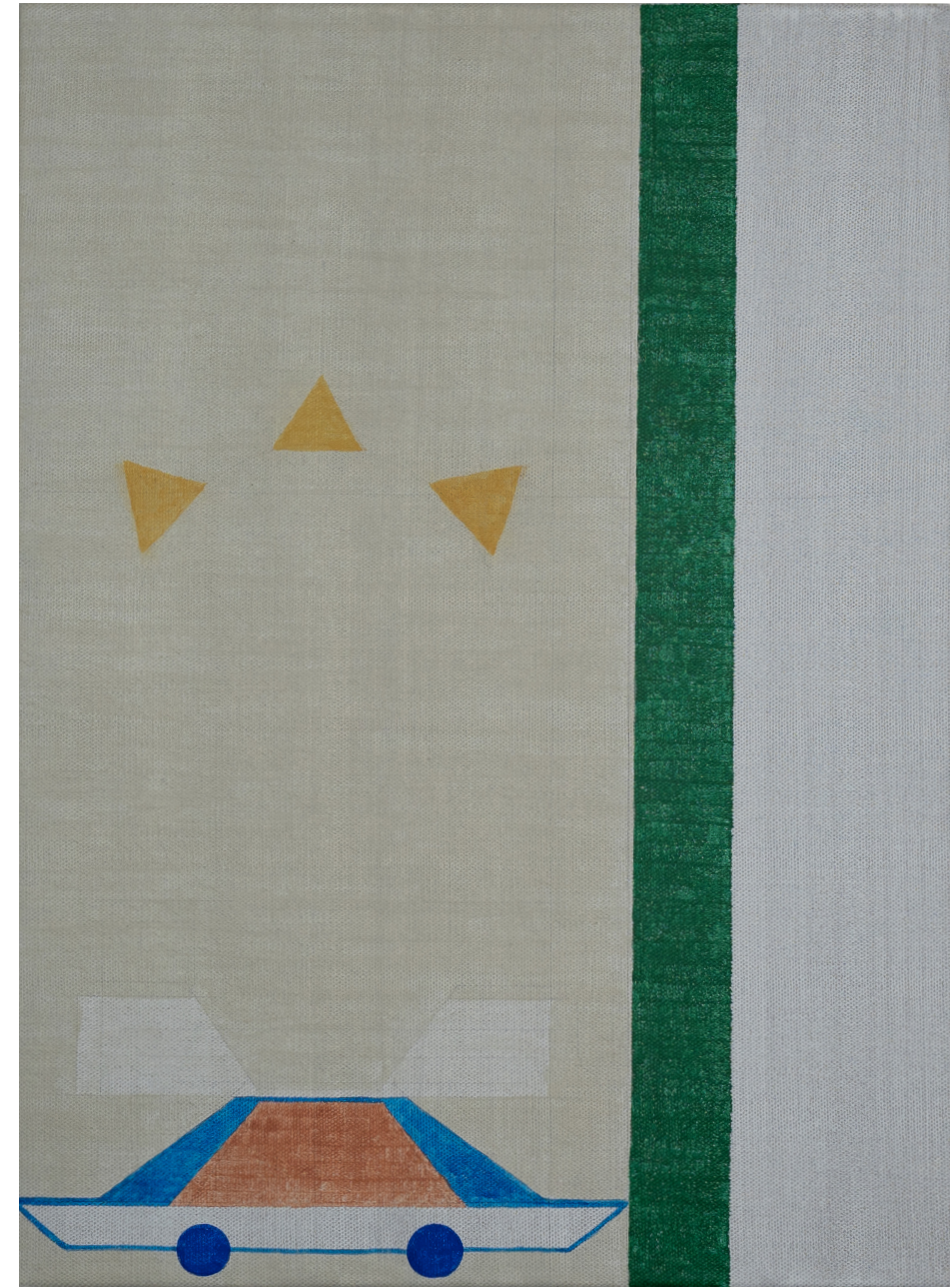
Untitled, 2022 Egg tempera on linen 26 x 18 7/8 in 66 x 48 cm