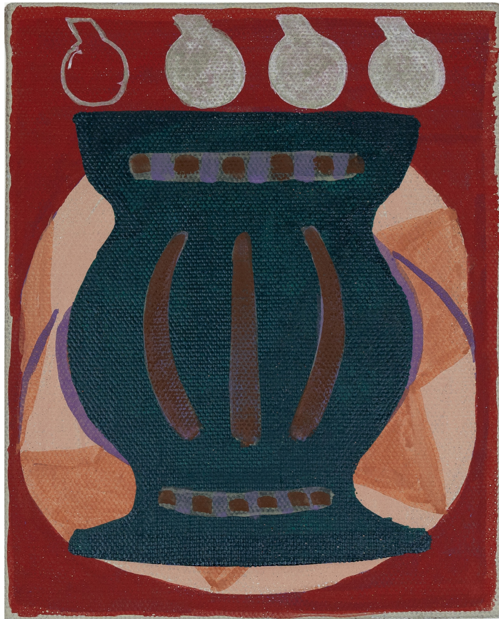
Untitled, 2022 Egg tempera on linen 9 7/8 x 7 7/8 in 25 x 20 cm