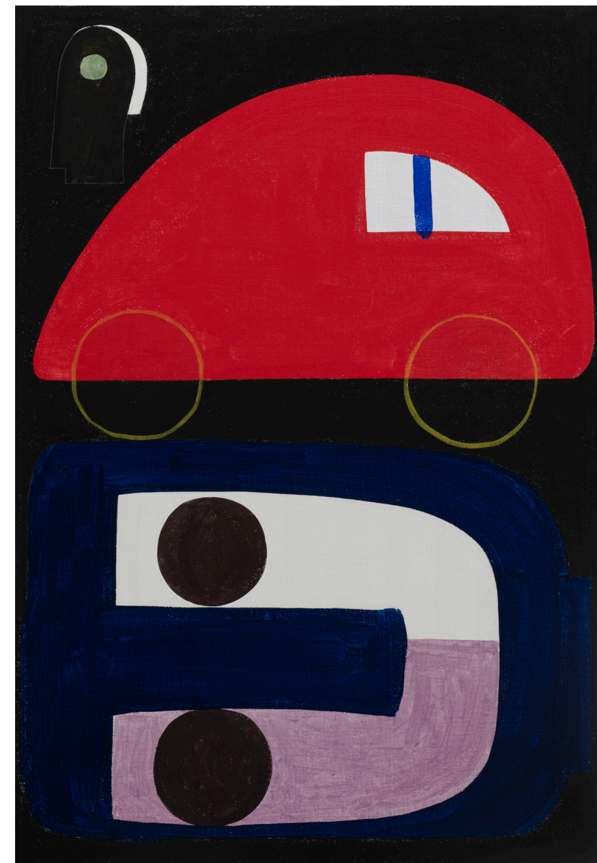
Untitled, 2023 Egg tempera on linen 41 3/8 x 28 3/8 in 105 x 72 cm