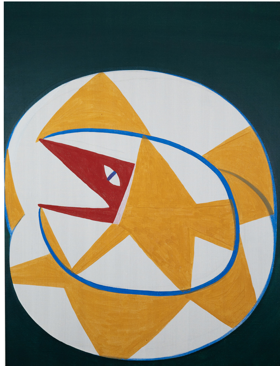
Untitled, 2022 Egg tempera on linen 50 x 38 1/4 in 127 x 97 cm