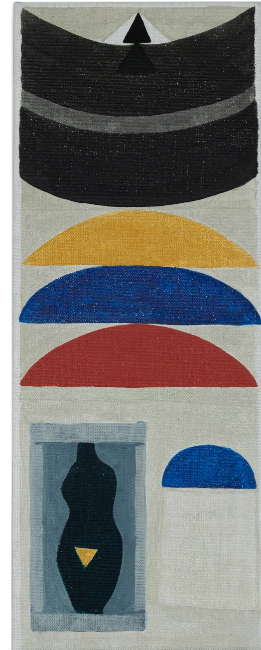
Untitled, 2022 Egg tempera on linen 17 3/4 x 6 3/4 in 45 x 17 cm