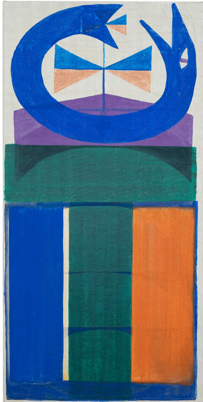
Untitled, 2022 Egg tempera on linen 31 7/8 x 15 3/4 in 81 x 40 cm