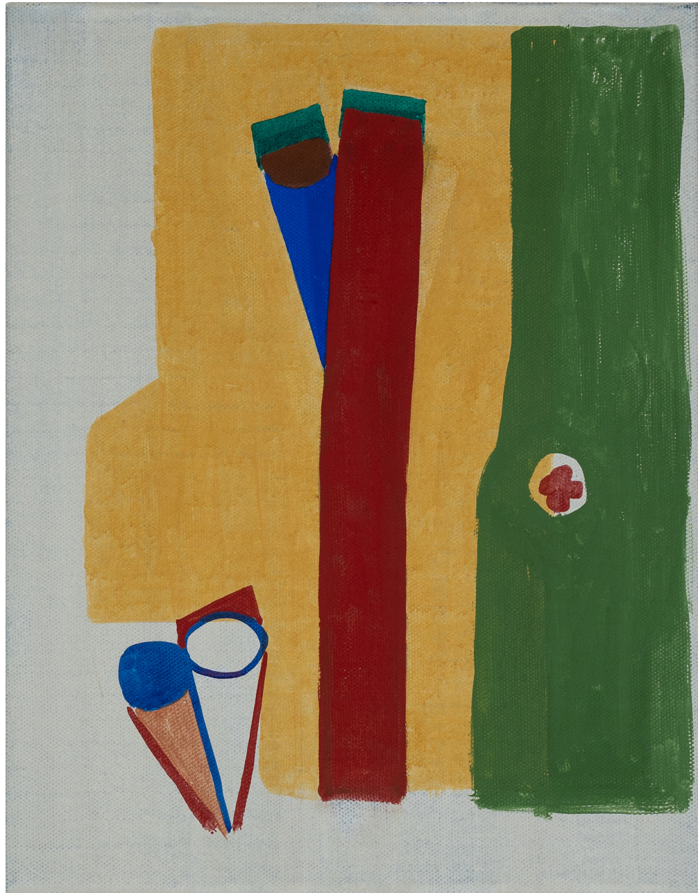
Untitled, 2022 Egg tempera on linen 17 3/4 x 13 3/4 in 45 x 35 cm