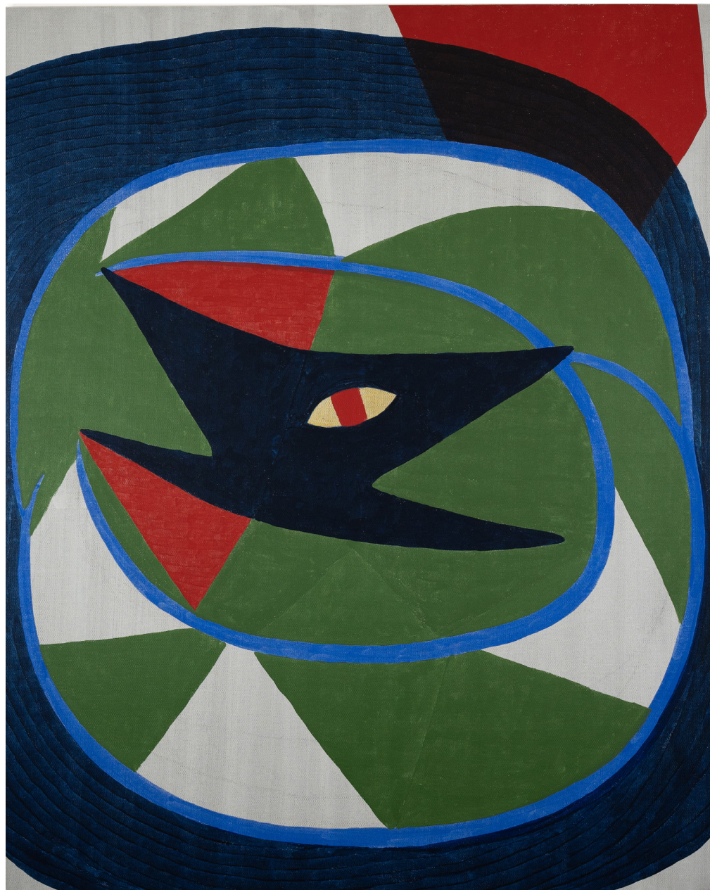
Untitled, 2022 Egg tempera on linen 50 x 39 3/4 in 127 x 101 cm