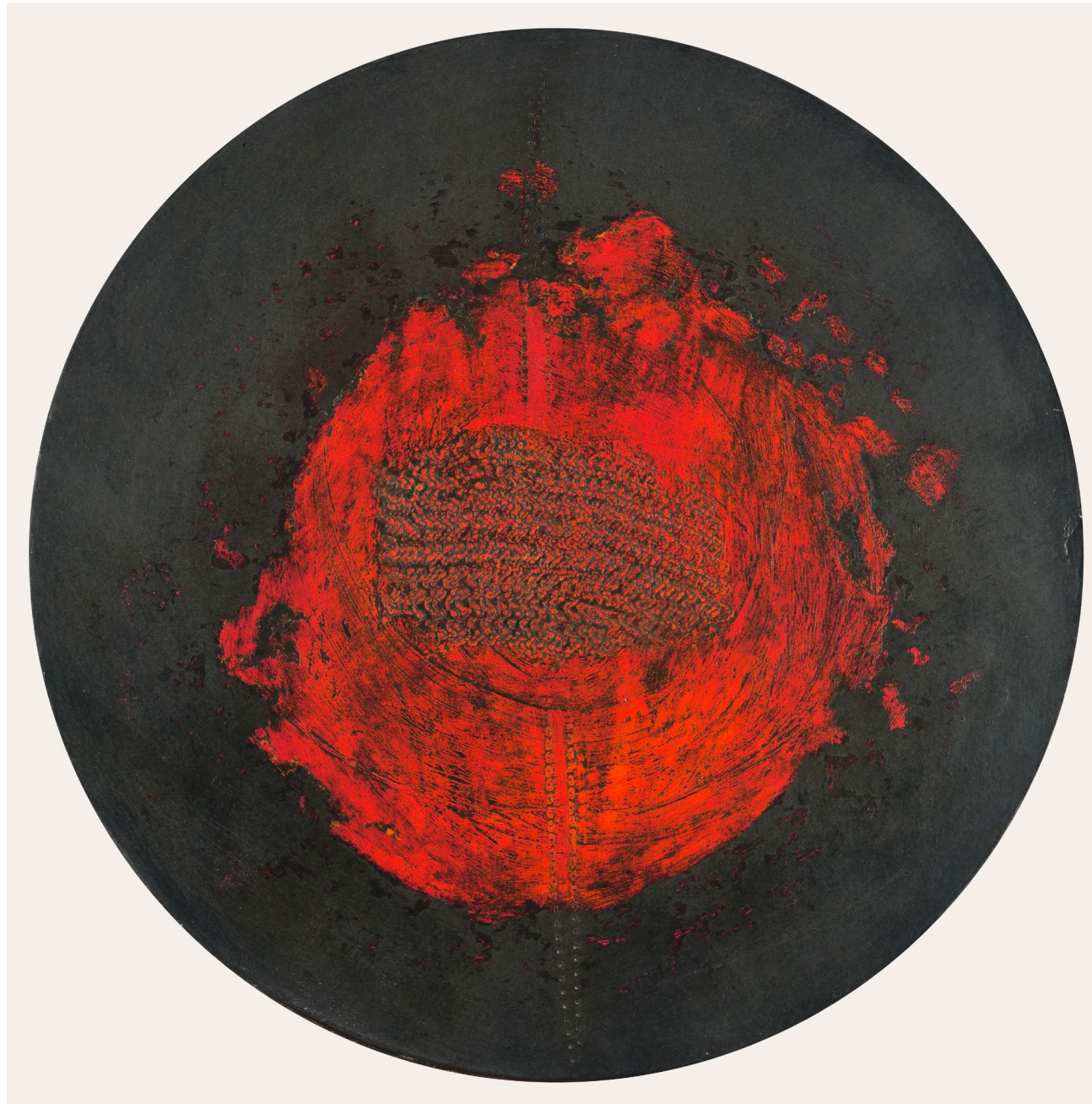
Senza titolo , 1960 Mixed media on board Diameter: 14 1/2 in Diameter: 36.8 cm