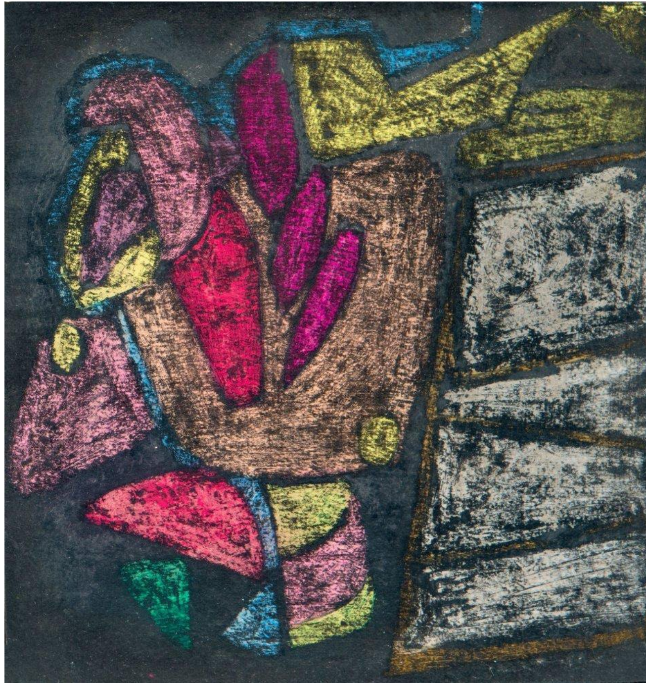
Untitled, 1959 Mixed media on black paper 6 1/2 x 5 7/8 in 16.5 x 14.9 cm