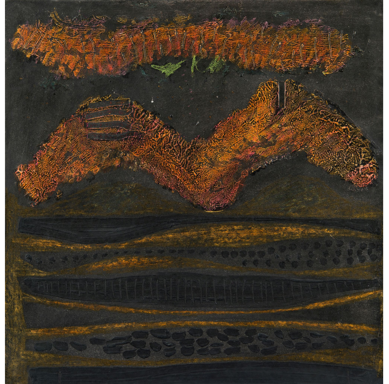
Senza titolo , 1960 Mixed media on board 19 5/8 x 19 5/8 in 49.8 x 49.8 cm