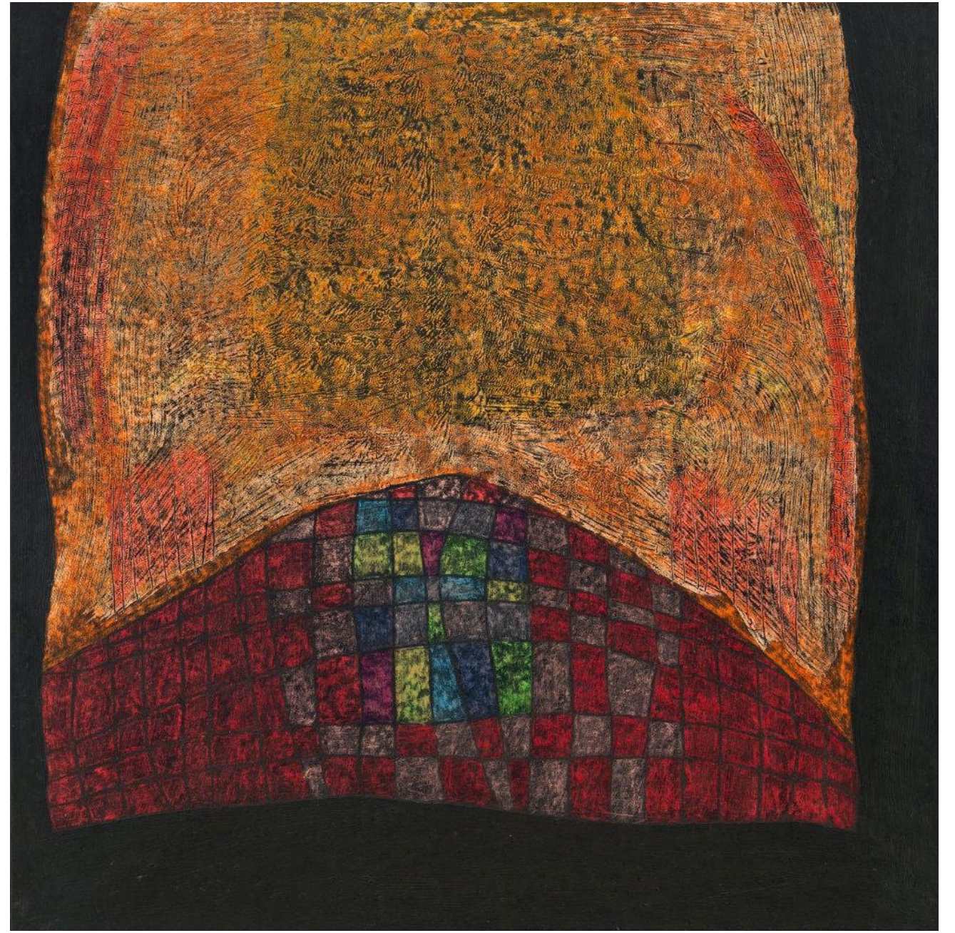
Architecture pour Rever, 1961 Oil on board 24 5/8 x 24 3/8 in 62.5 x 61.9 cm