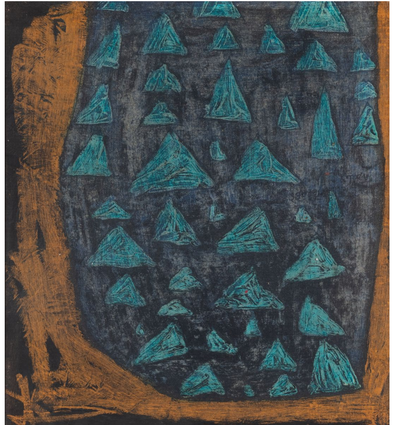
Untitled, 1965 Mixed media on board 6 1/2 x 5 7/8 in 16.5 x 14.9 cm