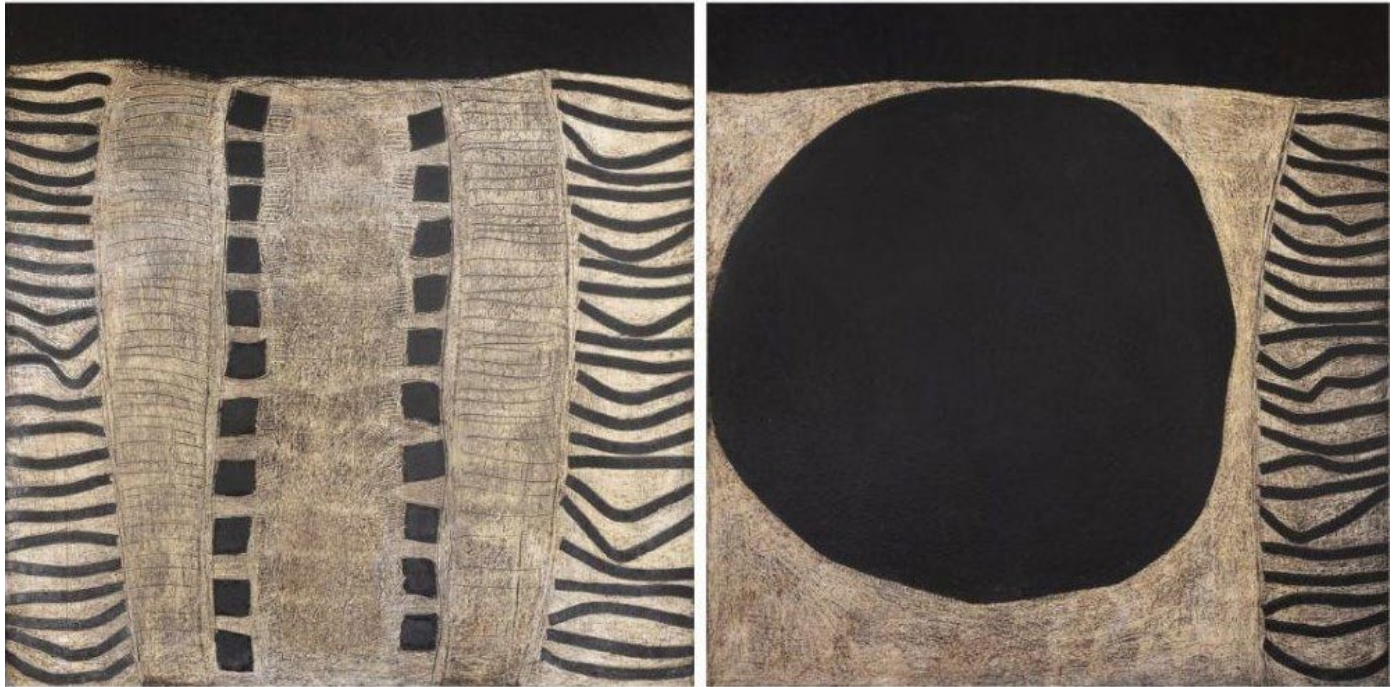
La Jeune Fille et la Mort I & II (Diptych), 1962