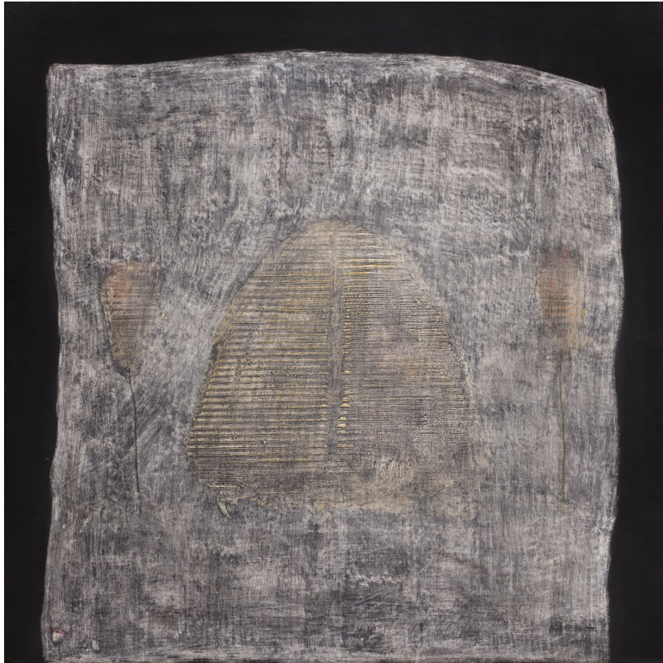
Composizione, 1960 Mixed media on board 28 x 28 1/8 in 71.1 x 71.4 cm