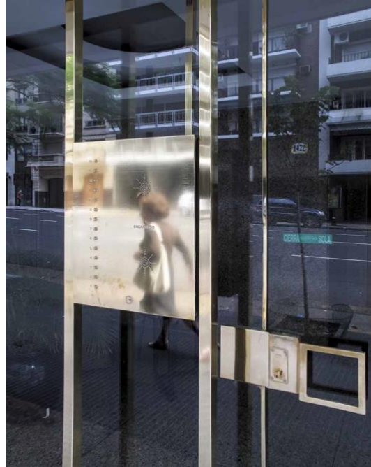
From the "Desaparecidos" series, Barrio Recoleta, Buenos Aires, 2009

Opening Reception: June 20 th , 2024, 5-8 pm 47 East 64 th Street, New York, NY 10065