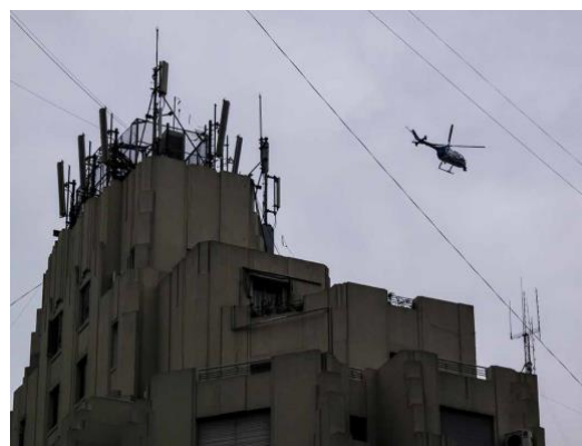
Barrio Recoleta No. 1, Buenos Aires 2009; Barrio San Nicolas No.1, Buenos Aires 2009