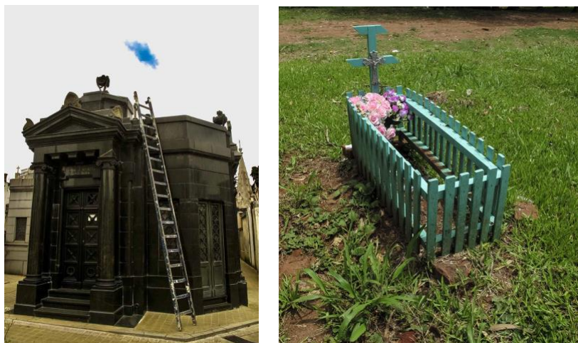
La Recoleta Cemetery No. 1, Buenos Aires 2009; Puerto Bemberg No. 2, Argentina 2009

"Balcer's photographic essay pushes us to wonder about the limits of art, and to explore the potential found in new conceptual forms of photographic expression. In a certain sense, it is an assertion that photography can still cast a light into mankind's darkest areas."